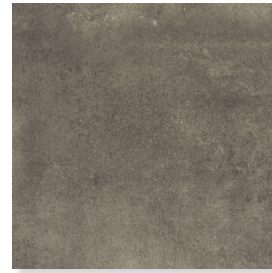
Greige PEI 4