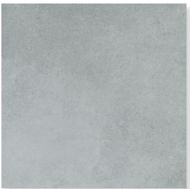
Grey PEI 5