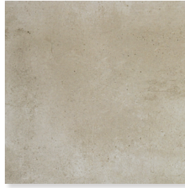
Beige PEI 5