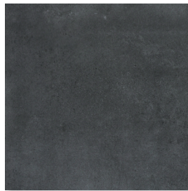
Black PEI 3